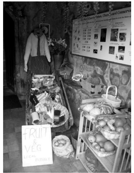
Just a few of the "High Street" shops at the Orton Church Exhibition