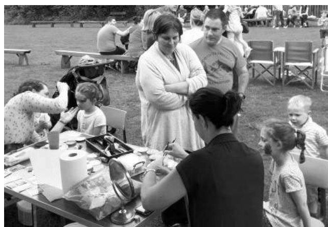
Some more scenes from the Families Together Sports Day