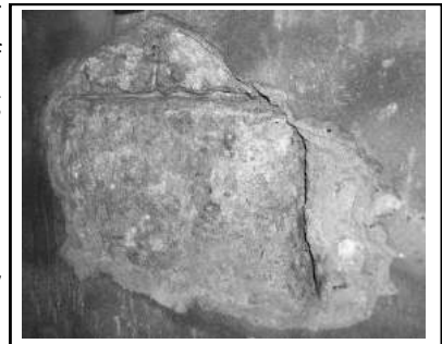
Render broken off inside wall

At that time, this was a widely accepted and recommended treatment, but since then, it has been realised that stone walls need to 'breathe', and that once water gains access to such walls, the sand-and-cement render serves to retain the water within the wall. This means that the walls are always wet, that the timbers in or on the walls will rot, and that the sand-and-cement render will be irregularly stained and ultimately lifted off by the water in the wall – all of which are happening in All Saints' church.