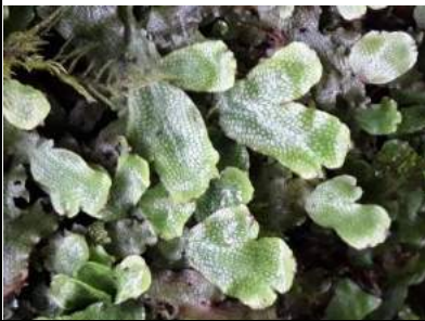
Snakewort, a liverwort

As lockdown continues, so does the home working apprenticeship. As a team we have learnt a huge amount about wildlife and how to interpret the natural world around us. You may have seen some of the apprentices on your daily exercise; peering into trees, examining flowers, exploring waterways, rifling through ID guides. They tell me they have been getting some strange looks! Their photographs and records tell me how they are discovering new worlds of liverworts under bridges, cosmoses of mosses flourishing on walls, universes of lichens in the trees. We have been Looking Out