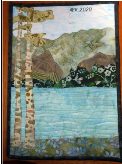
Lakes and Fells

years of my life which has been in Cumbria (Orton and Roundthwaite) and therefore it had to be lakes and fells, looking empty now without visitors.