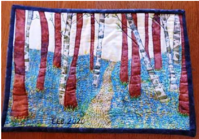
January 2020: Winter Sunset