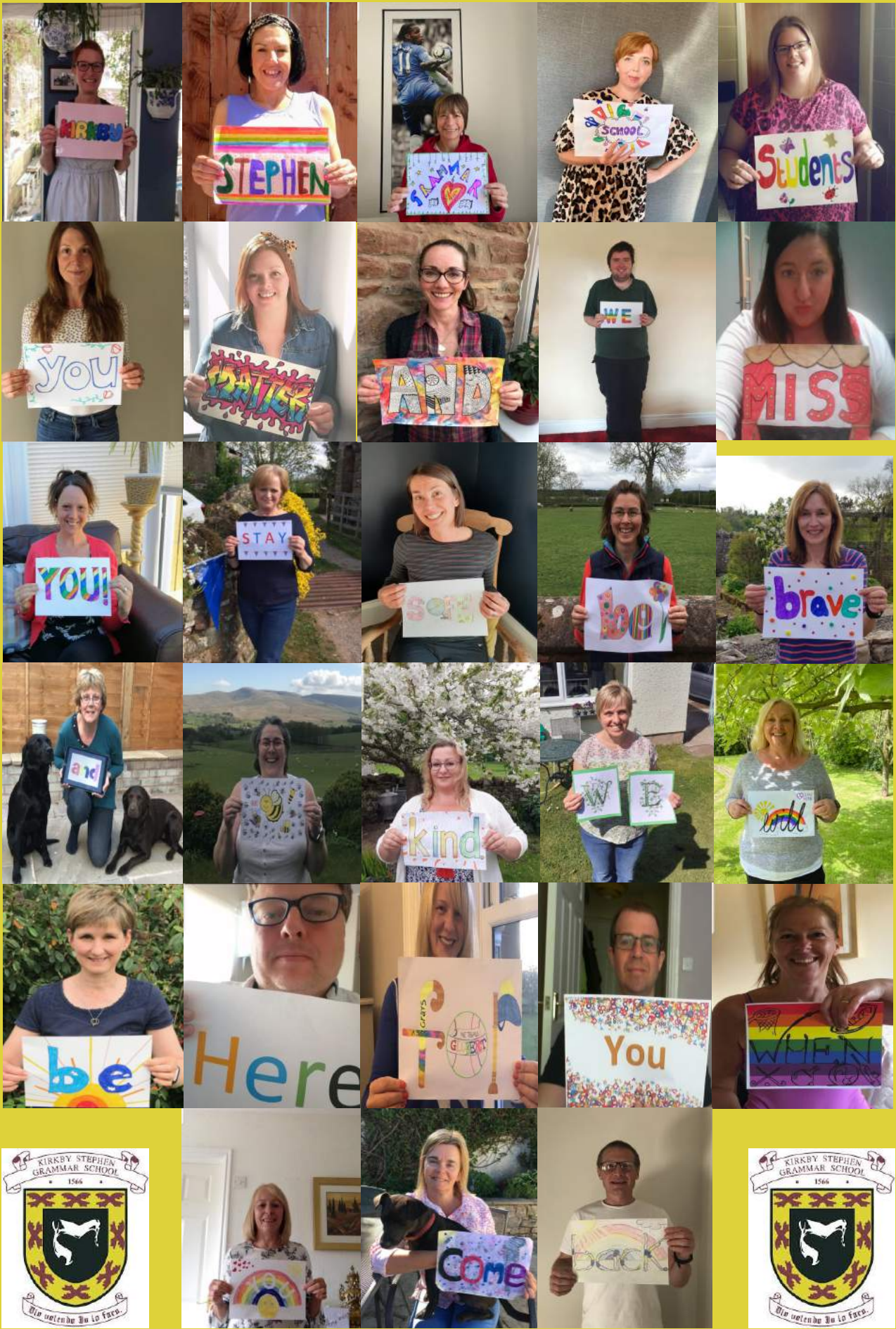
KSGS message to the students

“Kirkby Stephen Grammar School students - you matter and we miss you! Be brave, stay safe and be kind. We will be here for you when you come back”.