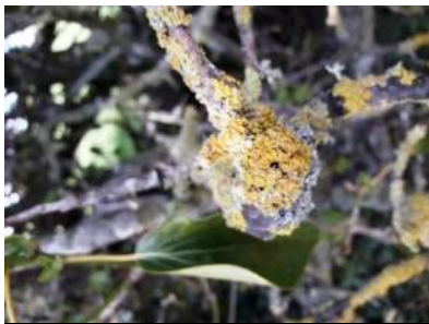
Xanthoria, a lichen

Another project that really opened all our eyes was the Small Scale