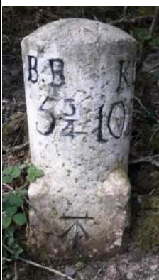
Mile Post with OS benchmark

Heritage Project, a Westmorland Dales Landscape Partnership project that we have started in our home environs. The idea is to create a record of Small Scale Heritage Features within the Westmorland Dales; features that often get overlooked. Post boxes, milestones, OS benchmarks and hogholes all tell a story of the past. Once you start looking, it's amazing how much heritage you start noticing.