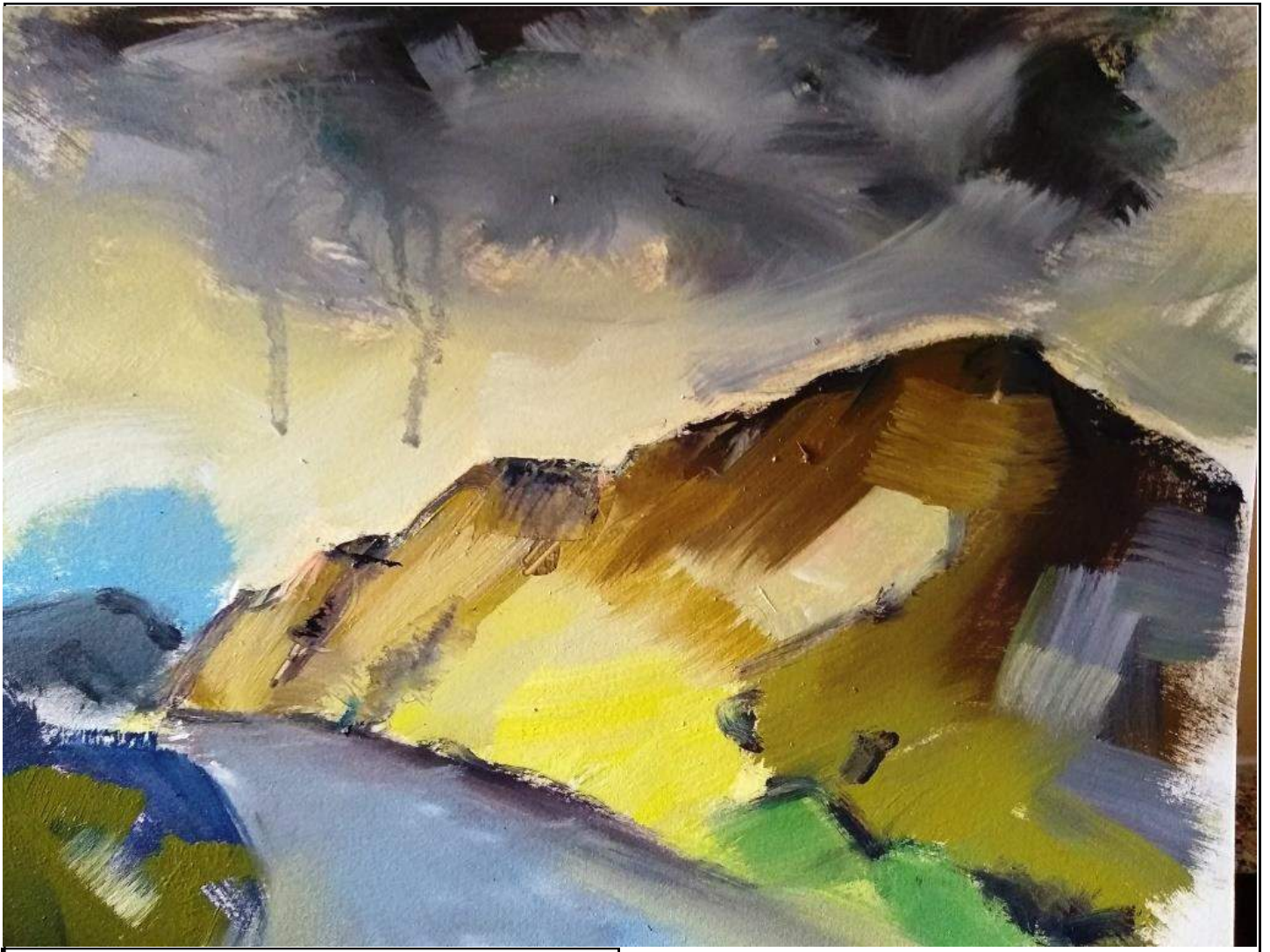
The Howgills Oil sketch by Julie Hoggarth