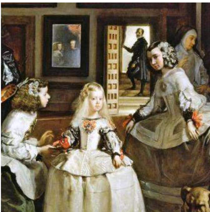
A detail of Diego Velazquez - "Las Maninas"