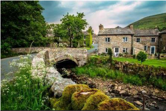
Thwaite Village

This is the last call for amateur photographers to enter a Yorkshire Dales Photography Competition – and be in with a chance of having their work exhibited and featured in a charity calendar.