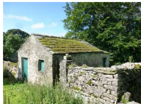
Photographs taken at Bowberhead during summer 2020 by Dave Wedd.