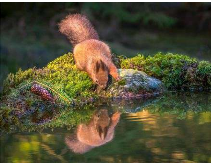
A welcome drink