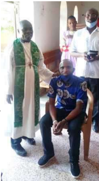
One of the Muslims now baptized into Christian faith.

Am happy to inform you that today I have been appointed a Canon in the Anglican Church of Uganda by the Bishop of my Diocese. I will be ordained a Canon on 21/11/2020. Pray for this day.