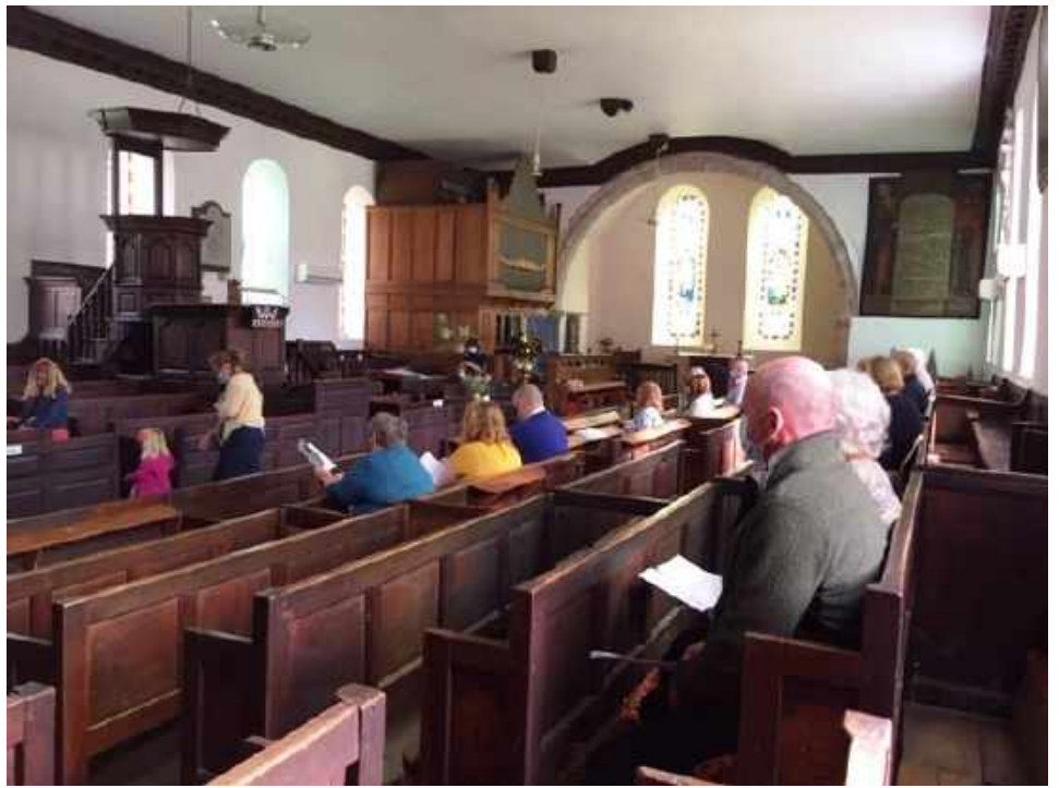
St. Oswald's first post-Lockdown service