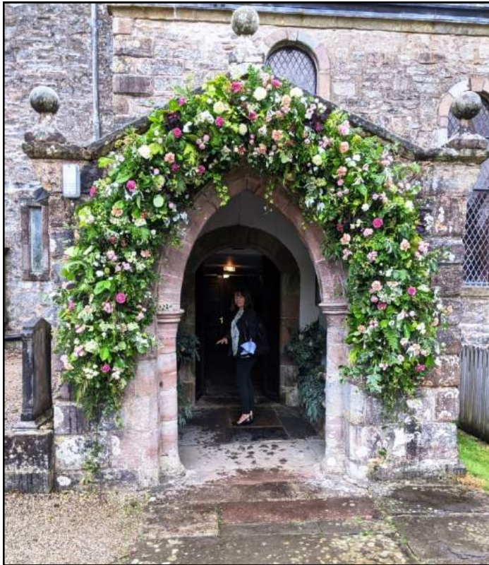
Doorway of St. Oswald's Church, after the wedding on Saturday 7 th August