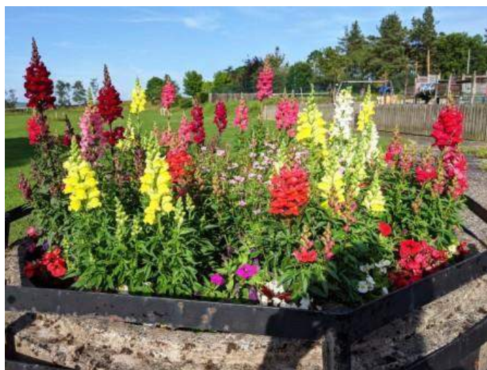
Flower Display at Tebay Recreation Ground