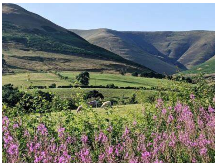
The Howgills towards Cautley Spout