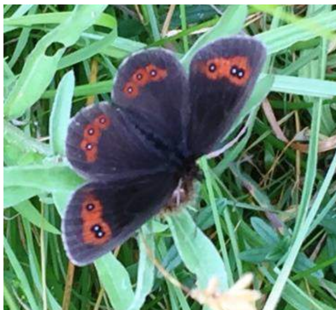
Scotch Argus butterfly in Smardale Gill; there are only 2 places south of the border where they breed.

We are delighted this year to have the friends from St Oswald's at Ravenstonedale joining us