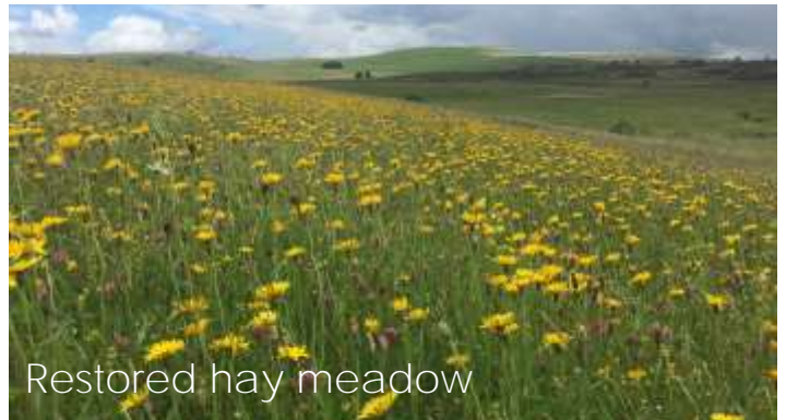
Restored hay meadow

Each farm decides how much land to commit to nature; for some it may be creating habitats in less productive areas whilst for others it may be a whole farm system. All however feel that looking at what they have through a fresh pair of eyes can only be positive in times of change.