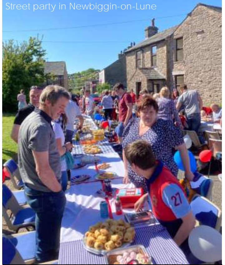
Street party in Newbiggin-on-Lune

More information from 07880 706485 - see you there!