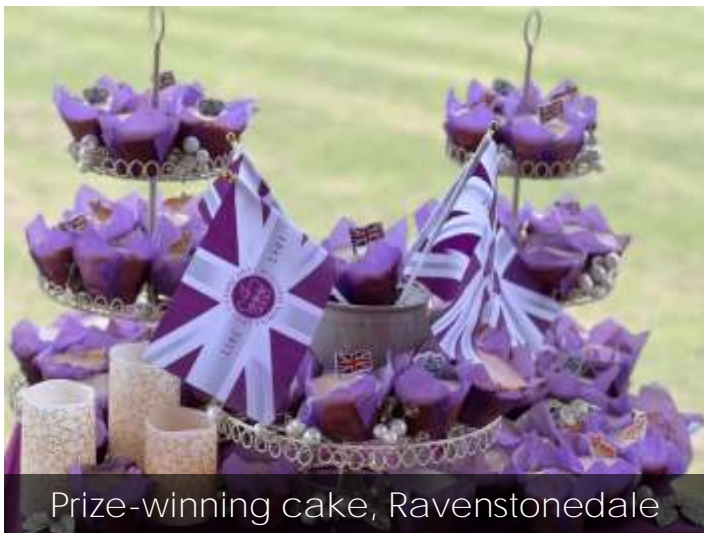
Prize-winning cake, Ravenstonedale