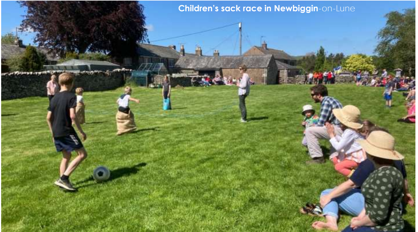
Children's sack race in Newbiggin-on-Lune