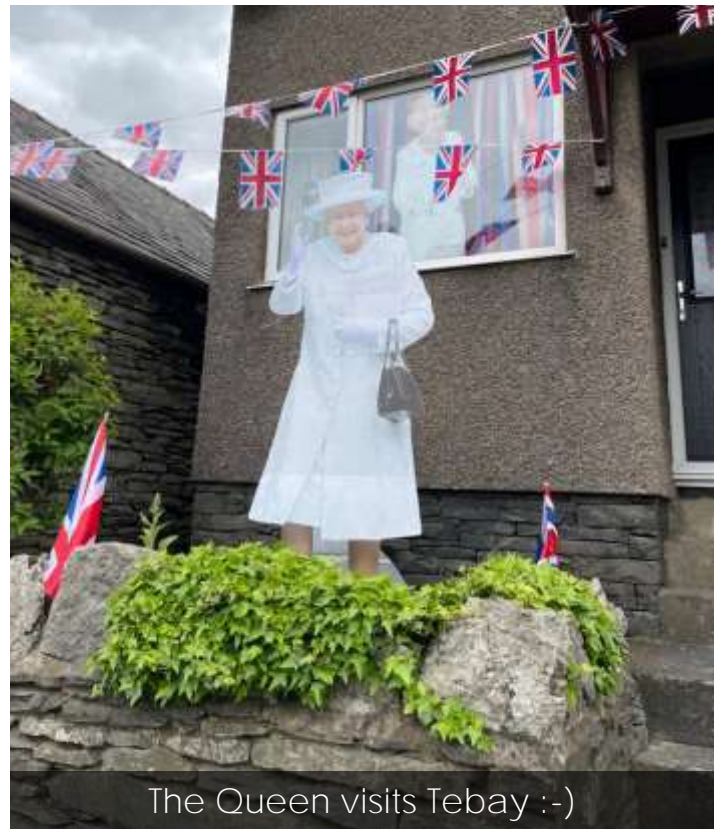
The Queen visits Tebay :-)