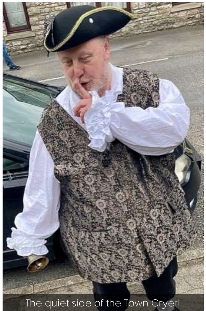
The quiet side of the Town Crier!