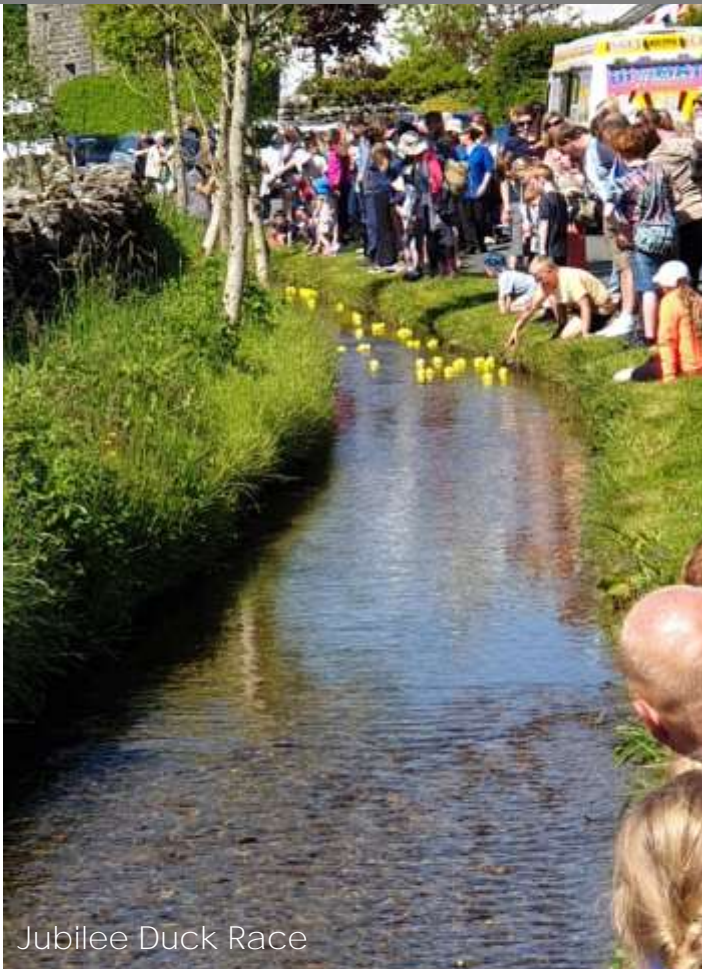
Jubilee Duck Race