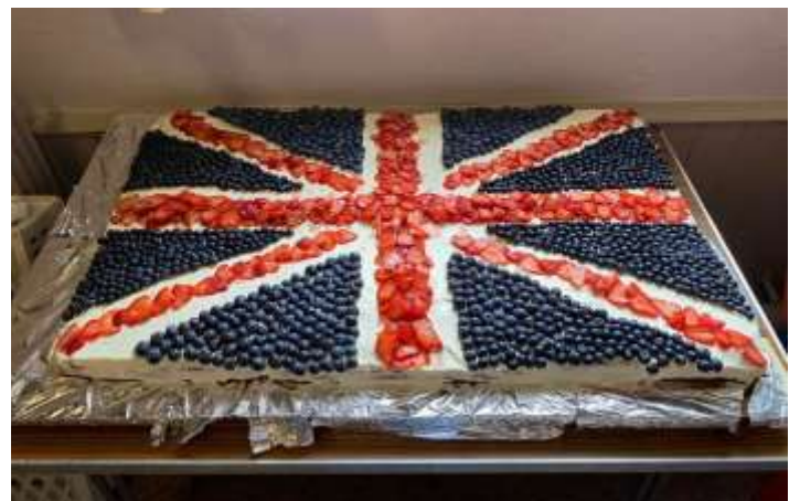
The Link — your local church & community magazine