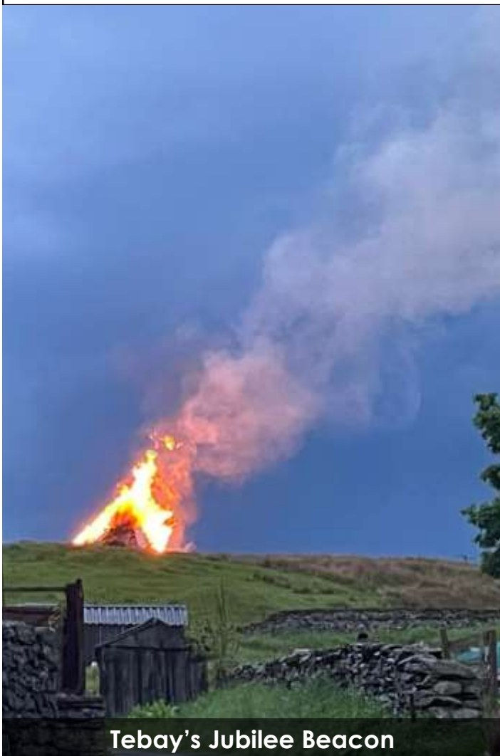
Tebay's Jubilee Beacon

Thank you to both communities for their continued support and fund raising for purchasing and renewing equipment.