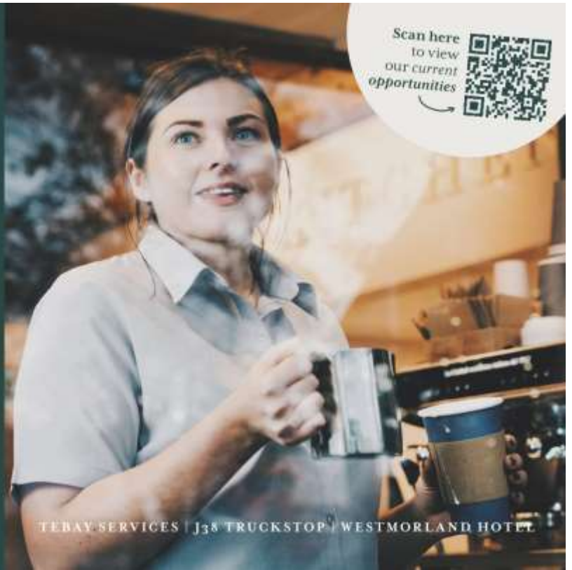
TEBAY SERVICES | J38 TRUCKSTOP | WESTMORLAND HOTEL