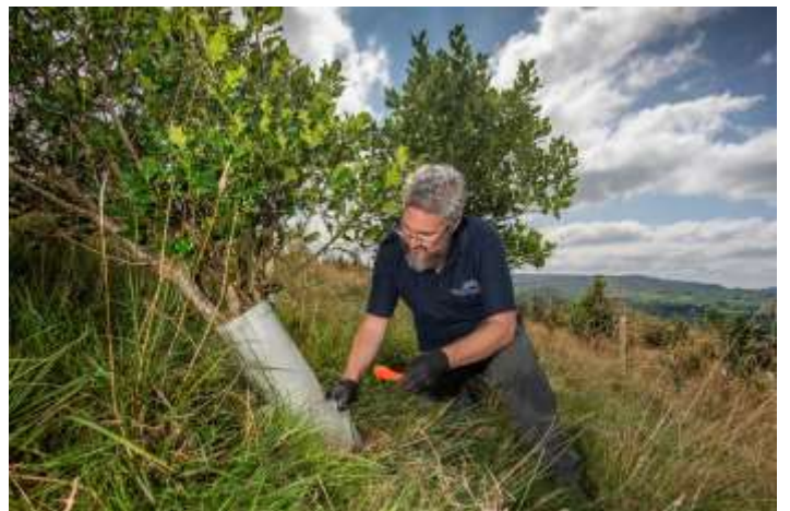
The Link — your local church & community magazine

The 'Plastics - Trees and Woodland' conference will build on the work of the Forest Plastics Working Group (FPWG) and partners over the last three years. The group grew from an initiative led by charity Yorkshire Dales Millennium Trust, who organised a conference on plastic tree shelters back in November 2019.