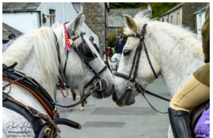
© Robert Hall Photography #Coolpics.co.uk — used with permission