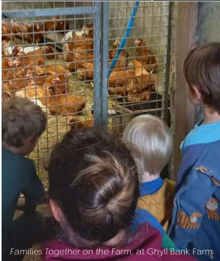
Families Together on the Farm, at Ghyll Bank Farm