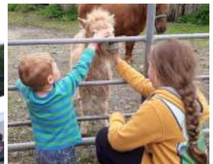
Families Together on the Farm

If you would like to find out more about Families Together in Tebay and Orton, who are one of the organisers of the Tebay Community Sports Day, do visit their Facebook page FamiliesTogetherTebayOrton