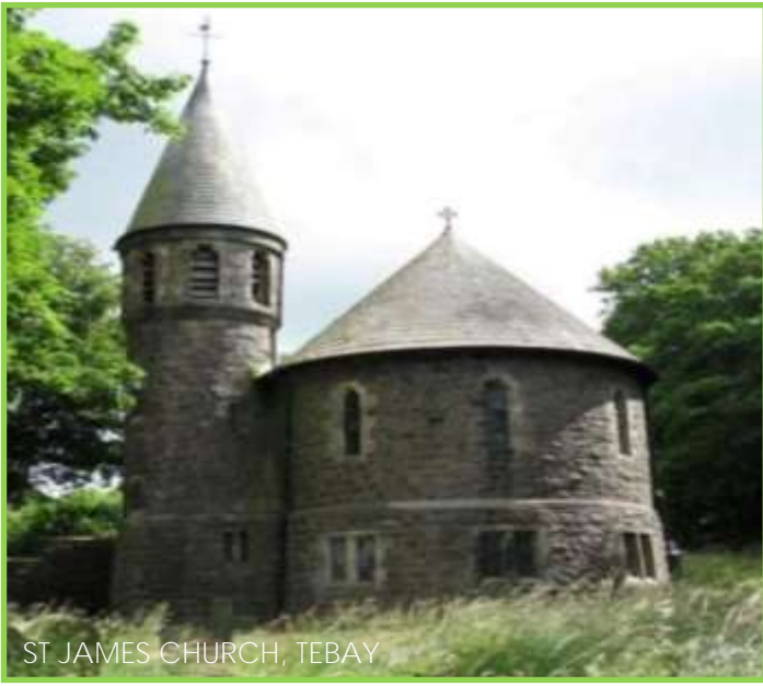
ST JAMES CHURCH, TEBAY