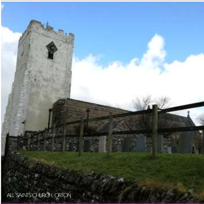
ALL SAINTS CHURCH, ORTON