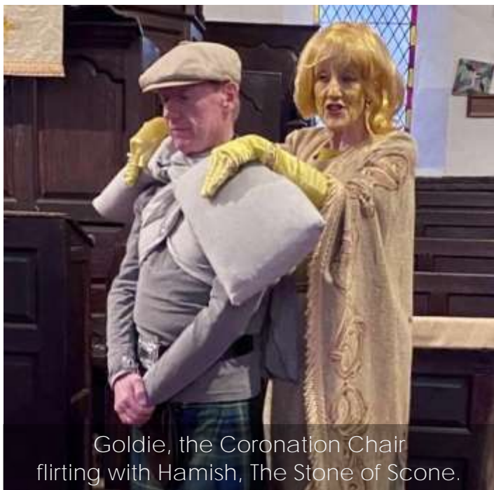
Goldie, the Coronation Chair flirting with Hamish, The Stone of Scone.

Goldie (the chair) and Hamish (the stone) are reunited, much to the annoyance of Hamish who would rather be at home in Scotland.