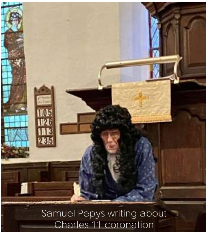
Samuel Pepys writing about Charles II coronation

Samuel Pepys appeared next, recording the coronation of Charles II in great detail. The last monarch of the House of Hanover was Queen Victoria who reigned almost as long as the queen most of us have known for all our life, Elizabeth II.