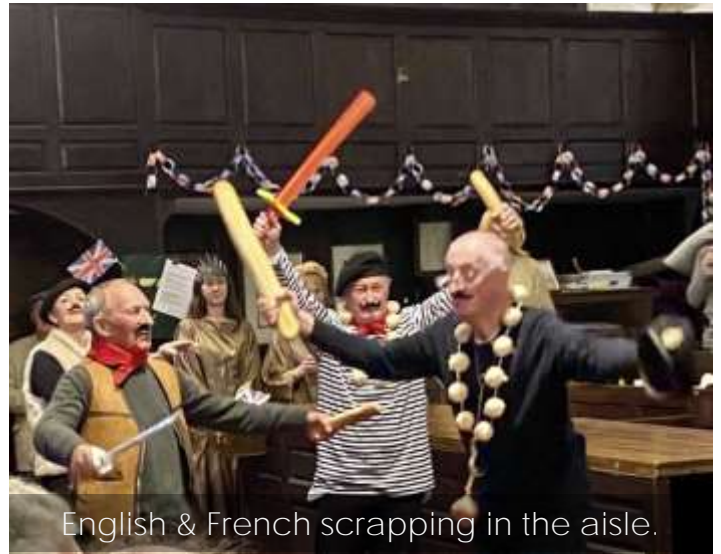
English & French scrapping in the aisle.

He was followed by Richard I, Richard the Lionheart, who was always away on Crusades. His brother John succeeded him. He was always at home and fell out with everyone, including the Pope and the French. The barons made him sign the Magna Carta in 1215. 'The King is not above the law'. He managed to lose the Crown Jewels in quicksand crossing The Wash and died suddenly after indulging in some iffy alcohol.