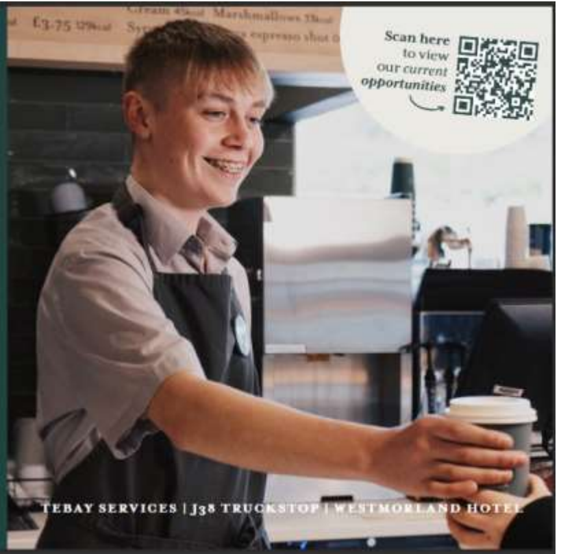
TEBAY SERVICES | J38 TRUCKSTOP | WESTMORLAND HOTEL